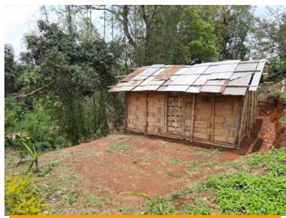
The Anganwadi (kindergarden school) constructed collaboratively this year.